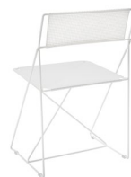
Off White Monochromatic